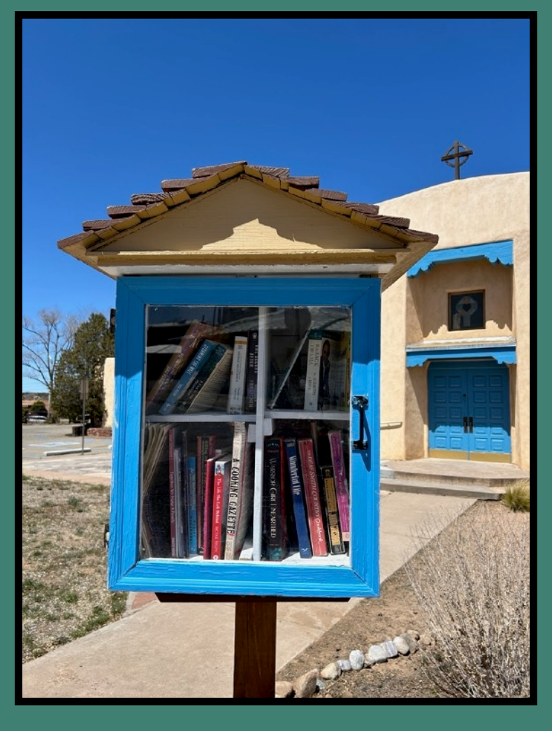
The Little Free Library set up by Creation Care and Building and Grounds!